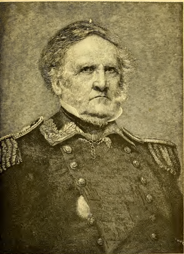
General Winfield Scott

Wood Engraving from the Original Photograph by Brady.